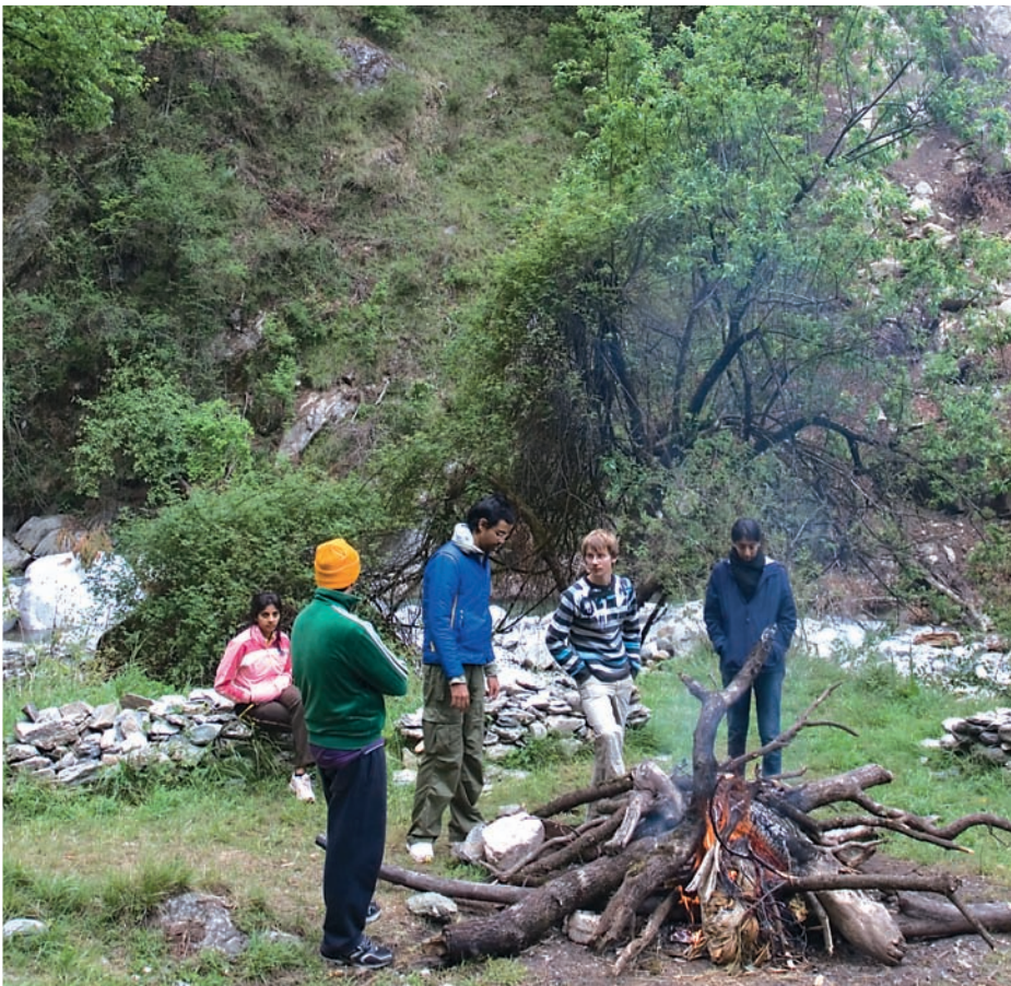
(Above) Shilt meadow and (left) the Rolla campfire