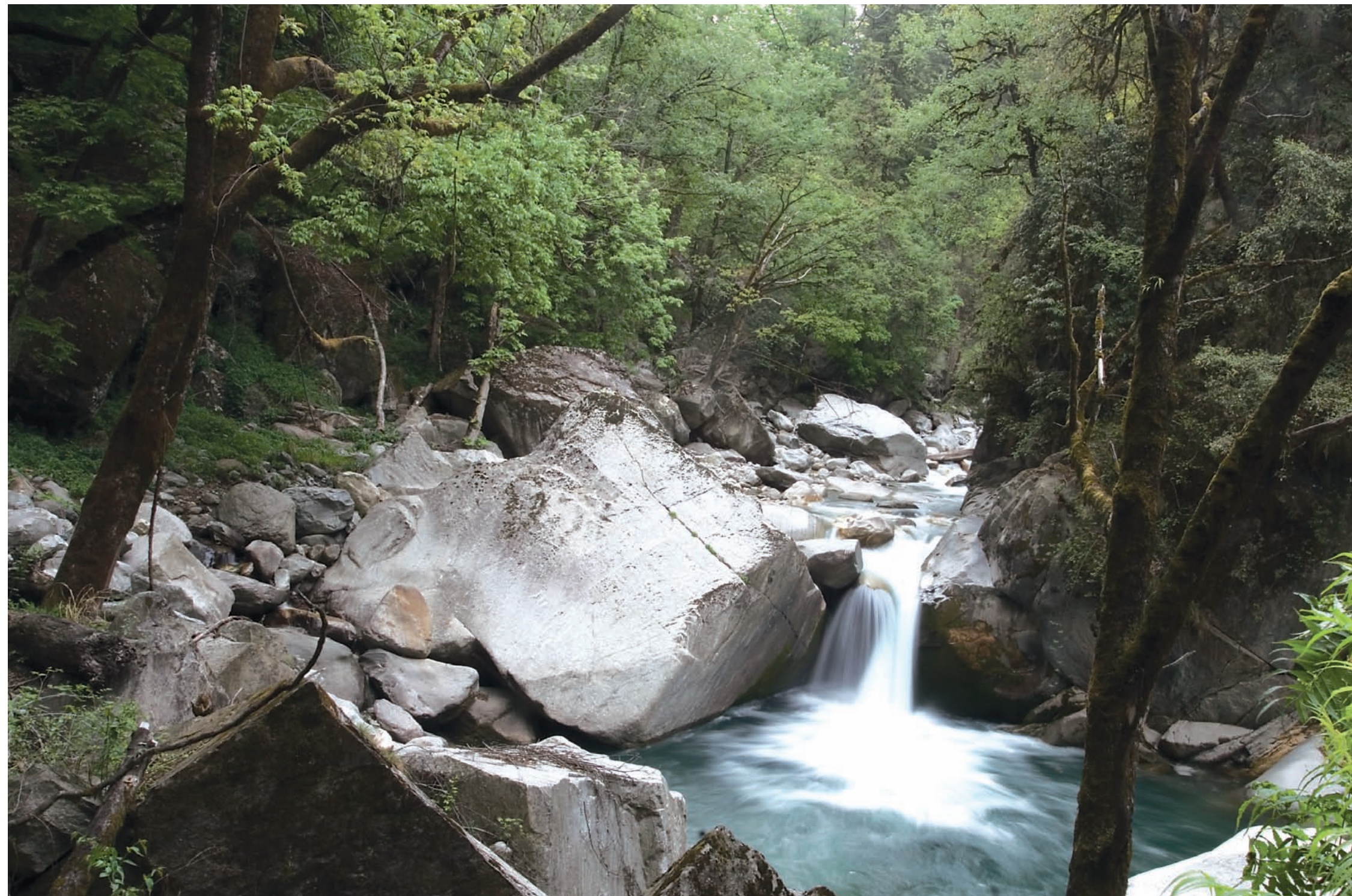
The Tirthan tumbles down its rocky course

The mountain weather gets as fickle as ever; the