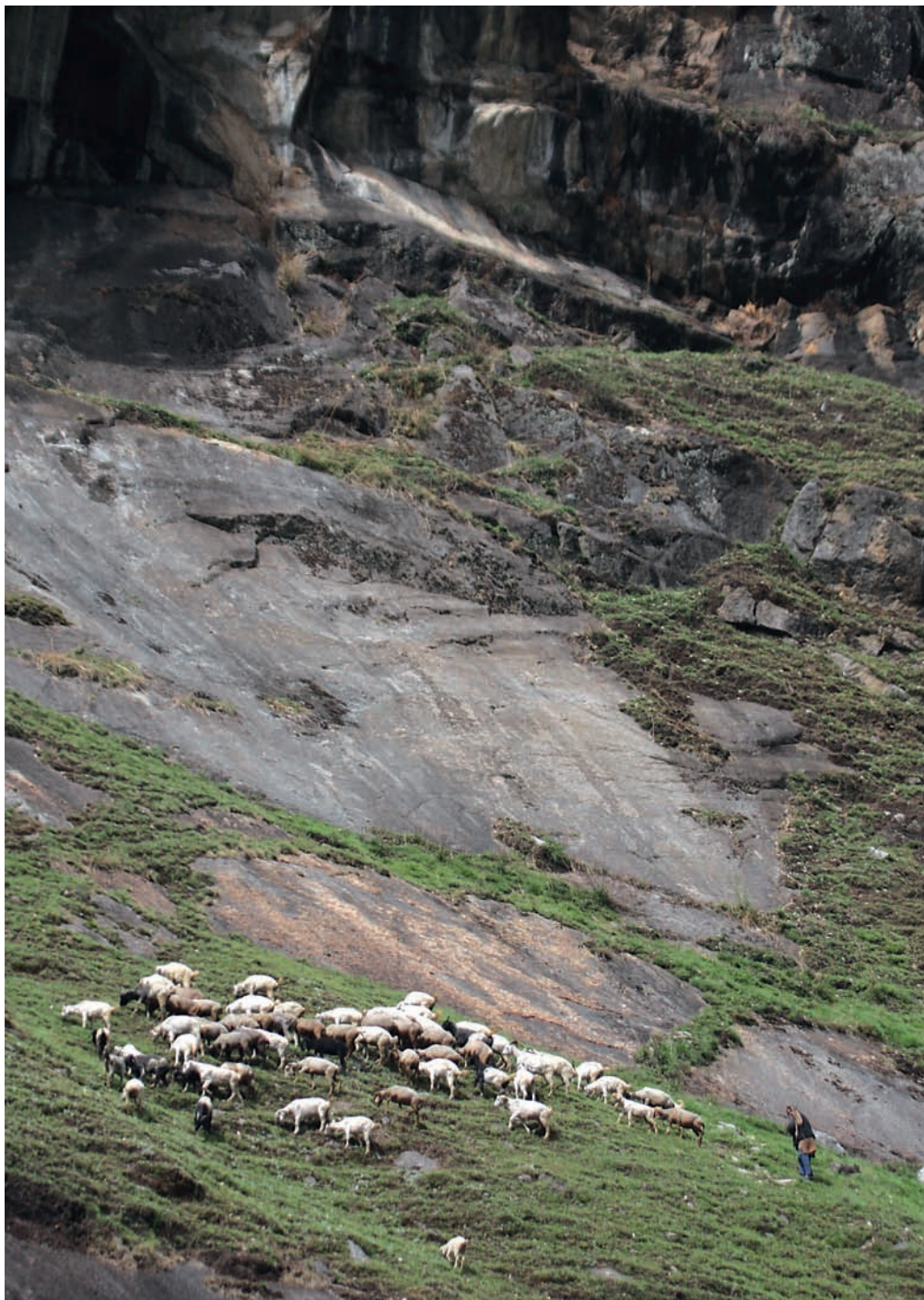
A shepherd guides his sheep over the rock face

below, you feel like Maria Von Trapp in the opening sequence of The Sound of Music , light-hearted and giddy with passion, bounding across a meadow full of yellow flowers. It's a wonder moment of a genie uncorked from a bottle and I gaze at the snow-capped peaks of Rakhundi and Chanani rising from the wild grass, beckoning me to run to them. This is clearly a pleasure for the chosen few. The Lammergeier or the bearded vulture soars below my feet as I live an enchanted moment on top of the world, with the jumble of hills bowing to me.